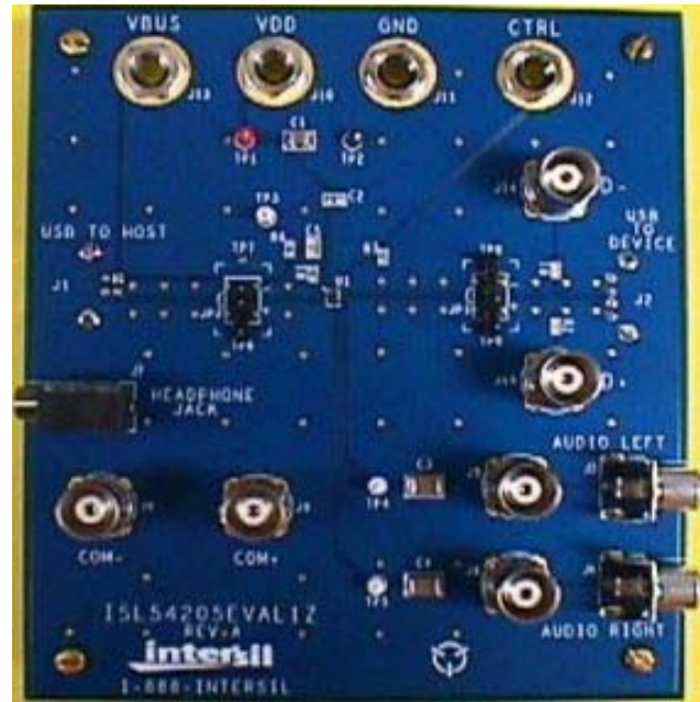
FIGURE 1. ISL54205AEVAL1Z EVALUATION BOARD (TOP VIEW)